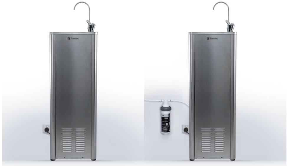
Filter Cartridge Installed Internally