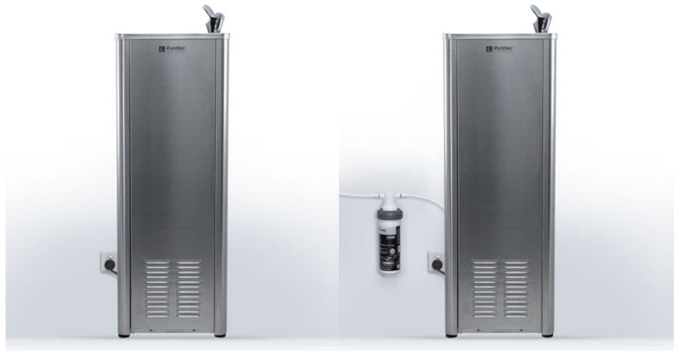
Filter Cartridge Installed Internally