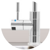
DFU230 Chrome Gloss Finish