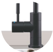
DFU200 Matt Black Matt Finish