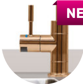
DFU265 Polished Rose Gold Gloss Finish