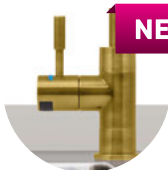
DFU285 Brushed Gold Gloss Brushed Finish