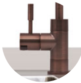
DFU250 Brushed Bronze Matt Brushed Finish