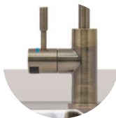
DFU270 Antique Brass Gloss Brushed Finish