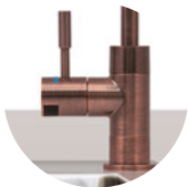
DFU260 Antique Rose Gold Gloss Brushed Finish