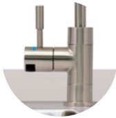
DFU240 Brushed Nickel Gloss Brushed Finish