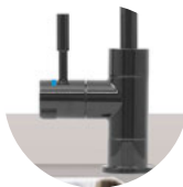
DFU220 Polished Black Gloss Finish