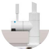
DFU210 Alpine White Gloss Finish